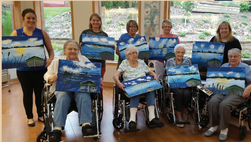
Elders, family and staff are pictured with the artwork they created during the guided paintings activity led by "The Art Nest" in Mt. Pleasant.