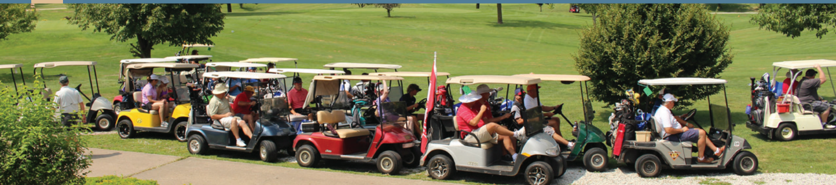
Golfers take to their carts at the gunshot start of the 8th HCHC Foundation Golf Benefit.